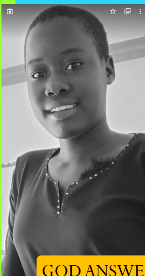
GOD ANSWERS PRAYER